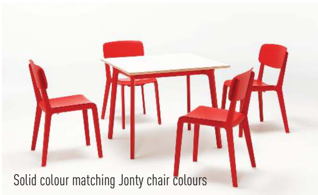
Solid colour matching Jonty chair colours