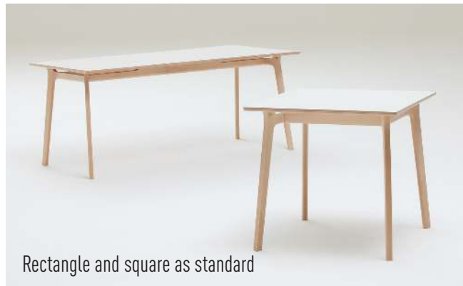
Rectangle and square as standard