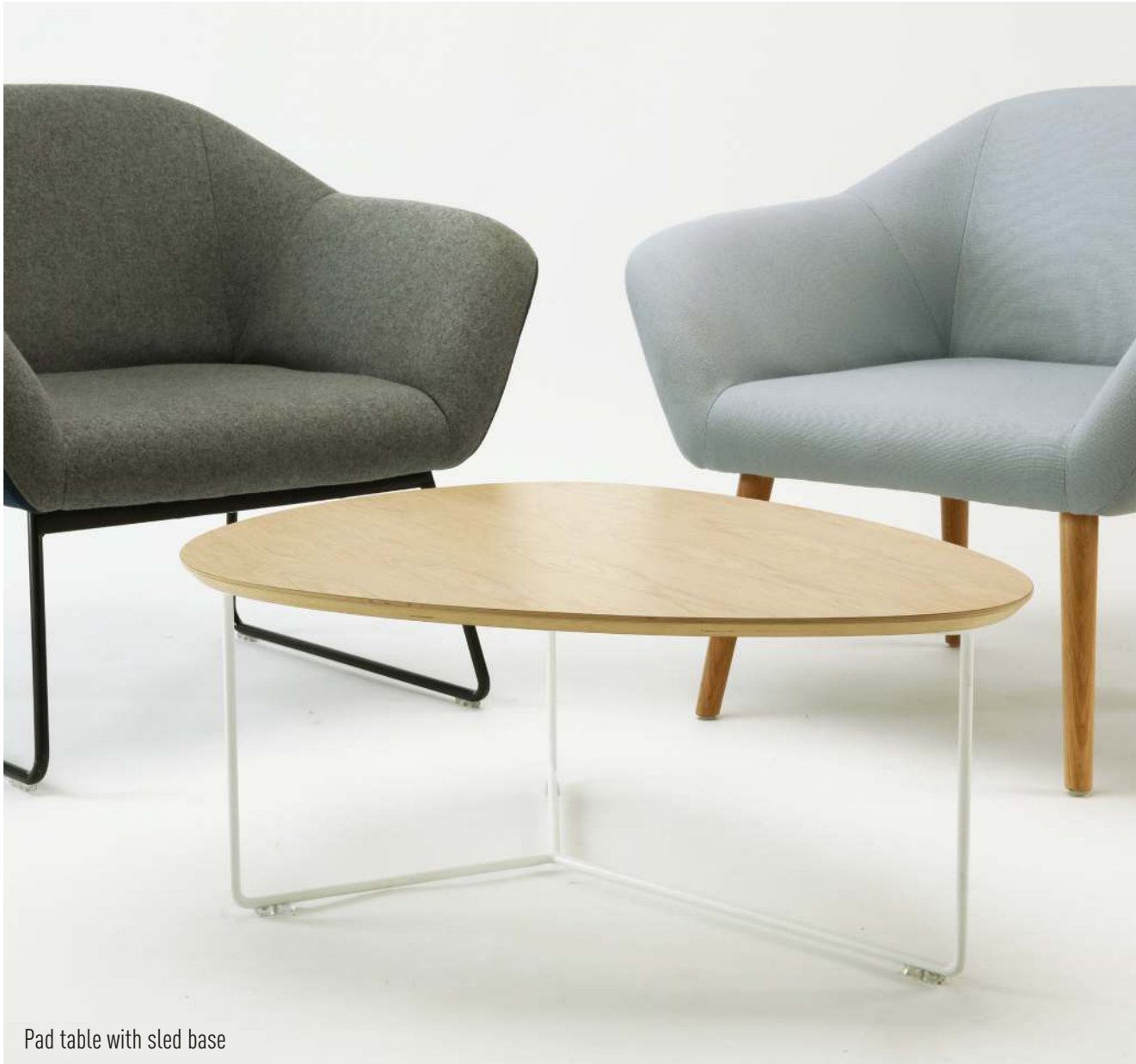
Pad table with sled base