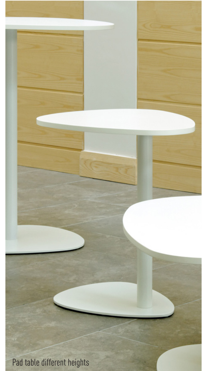
Pad table different heights